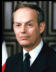
Bobby Inman , Admiral, U.S. Navy, (Ret.)