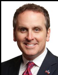
Bryan Hughes , State Senator