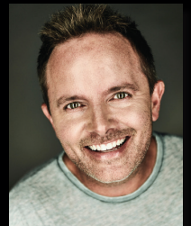
Chris Tomlin , Grammy-winning singer/songwriter