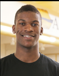
Jimmy Butler , NBA player, Olympic Gold Medalist

Almost a century of exceptional graduates including Grammy and Academy Award-winners, actors, award-winning journalists, educators, business leaders, political figures and professional athletes.