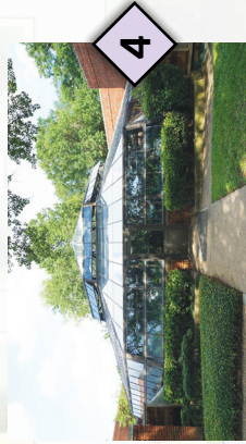
Vaughn Conservatory Campus Tours Housing Tours