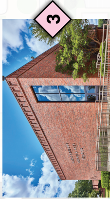
Genecov Financial Aid Information Session