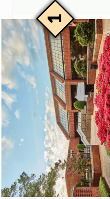
Rogers Student Center Event Check-In Academic Showcase