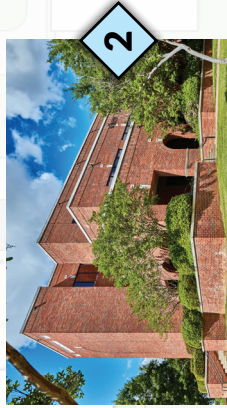
White Administrative Services Center Application Assistance Career Planning Information Session