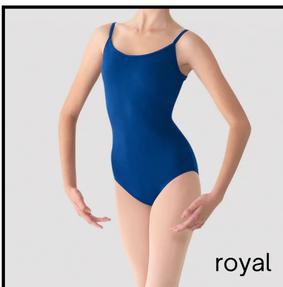
PP LEVEL 3