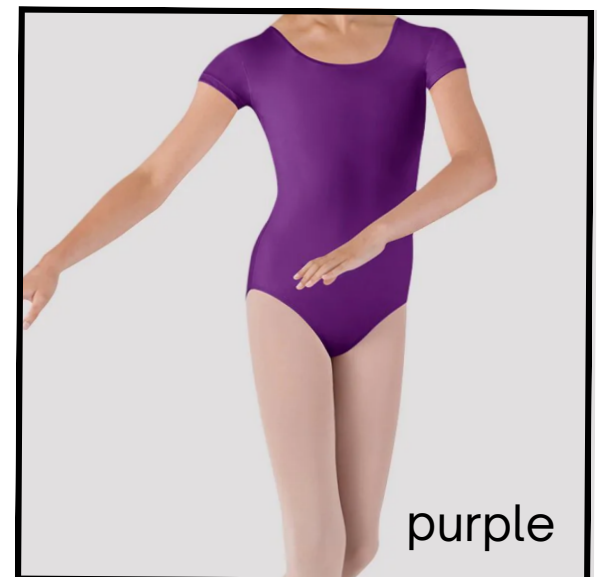
PP LEVEL 2