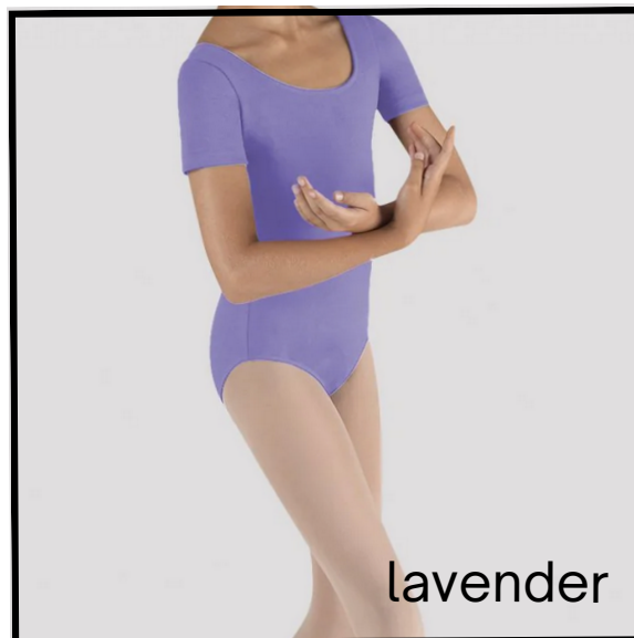
INTRO TO BALLET 1 & PP LEVEL 1