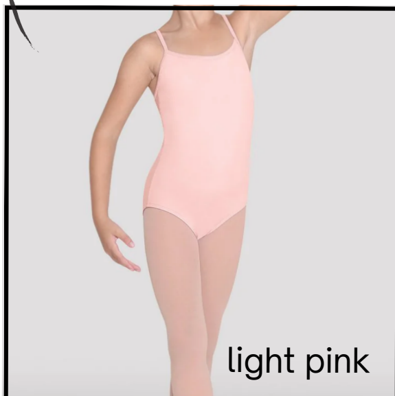
ALL PRE-BALLET & COMBO LEVELS