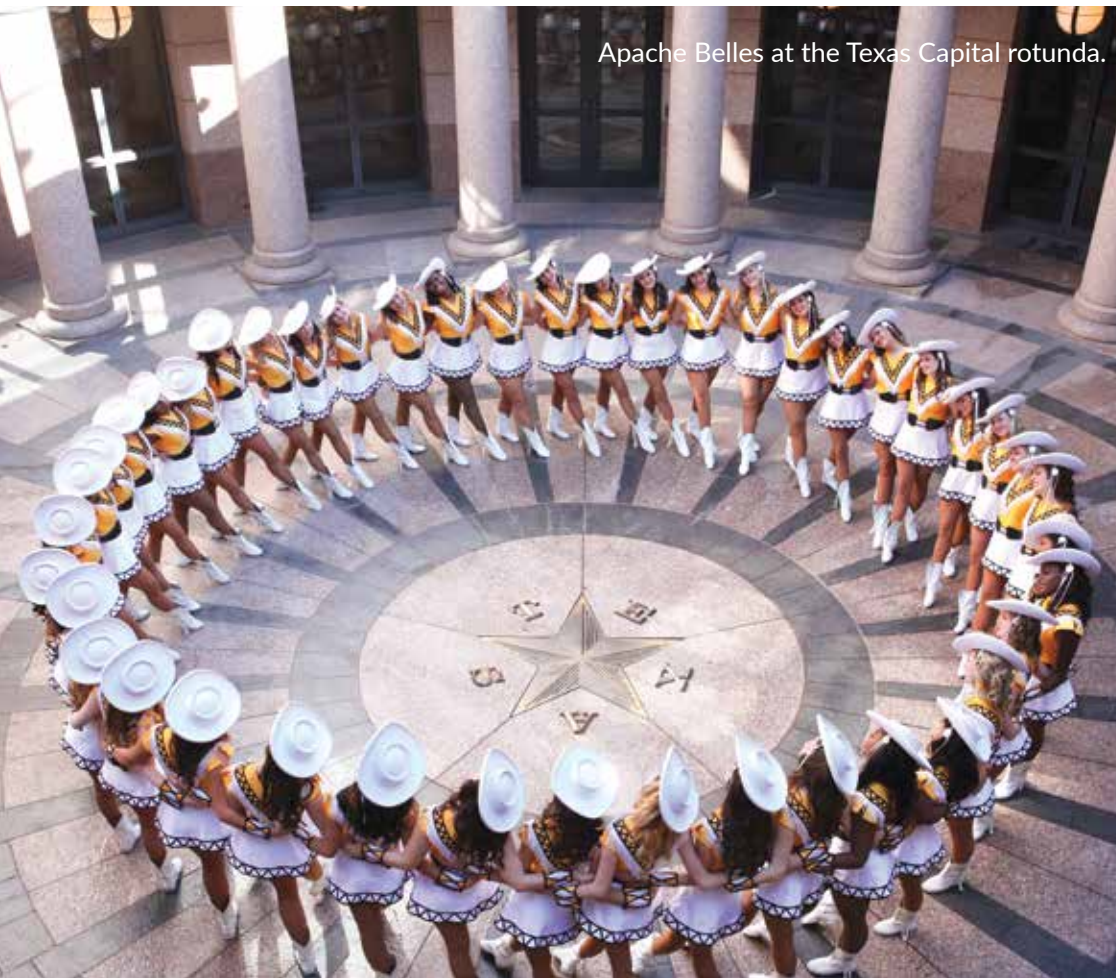
Apache Belles at the Texas Capital rotunda.

Award-winning actor | Theatre Major, Class of 1989