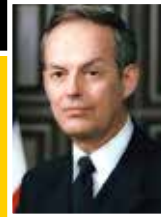
Bobby Inman, Admiral, U.S. Navy, (Ret.)