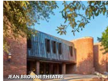
JEAN BROWNE THEATRE