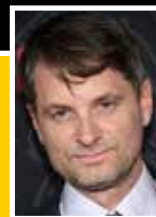
Shea Whigham, Actor