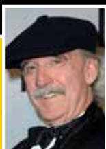
Will Jennings, Grammy and Academy Award winning songwriter