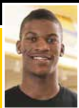
Jimmy Butler, NBA (76ers)