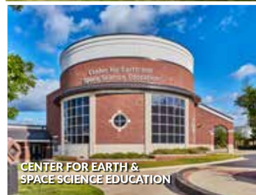
CENTER FOR EARTH & SPACE SCIENCE EDUCATION