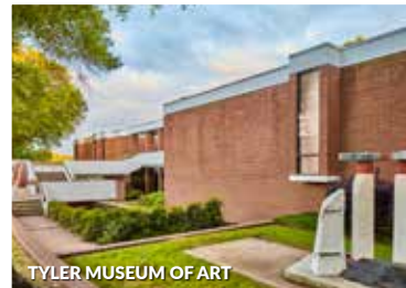
TYLER MUSEUM OF ART

TJC is the College of East Texas, and we're proud to be a part of our community's vibrant arts and entertainment scene.