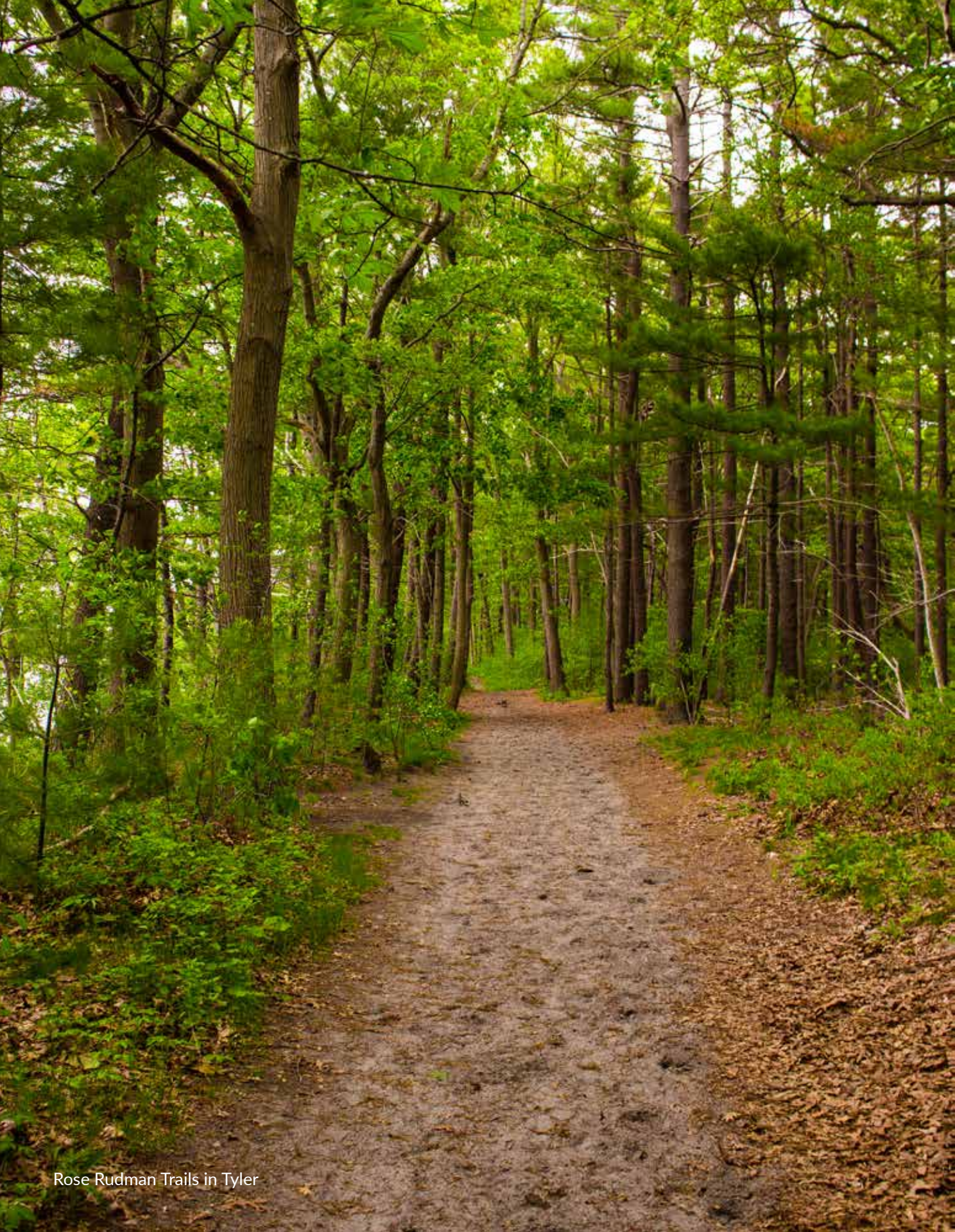
Rose Rudman Trails in Tyler