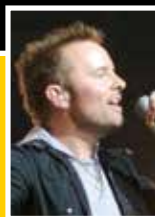
Chris Tomlin, Grammy award- winning songwriter, singer